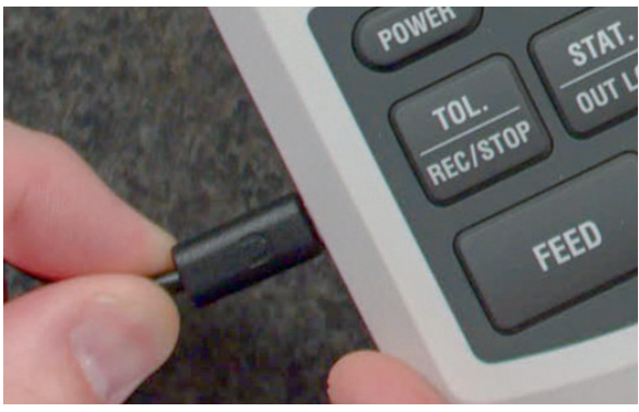
USB connection allows collected data to be easily transferred from the DP-1VA to the PC. The output is HID or VCP so data can be sent directly to Excel or data collection software such as IT-Pak or MeasurLink.