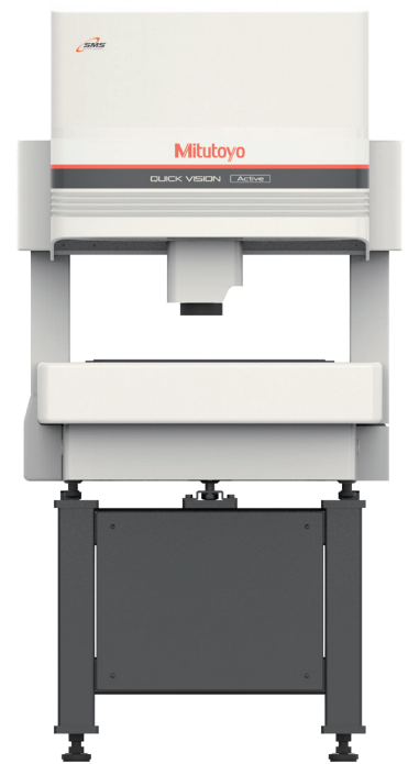
QUICK VISION Active 404