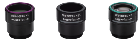
1X and 2X interchangeable lens (optional)

© 2025 Mitutoyo America Corporation, Aurora, IL