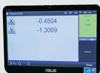
64PKA-M2-P M2 Standard Retrofit