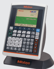
264-161-13A QM-Data 200 (Arm Type Retrofit)

Allows for continuous measurement of features, while storing data for post process analysis.