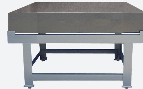
Granite Surface Plate ▲