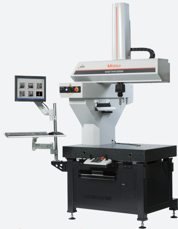
MiSTAR 555 ▲ Shop Floor CNC CMM