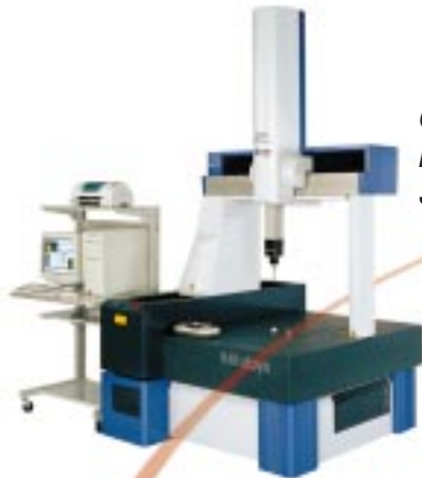
Coordinate Measuring Systems