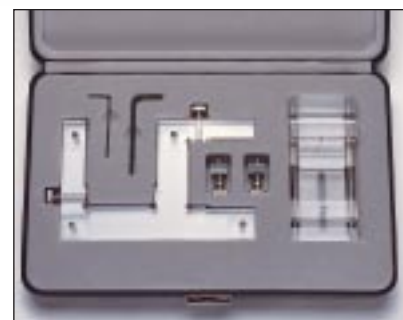
Order No. 64PMI109K