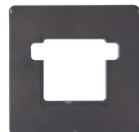
378-055 (3" x 3")