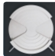
378-051 (ø3" to ø6")