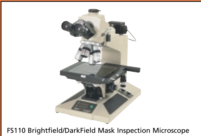
FS110 Brightfield/DarkField Mask Inspection Microscope

The FS110 Microscope can be configured to fit a wide variety of applications from metallurgy to micro-electronic component inspection. The large stable base accepts all Mitutoyo Ultra Long Working Distance optics that are available, in magnifications from 1X to 200X.