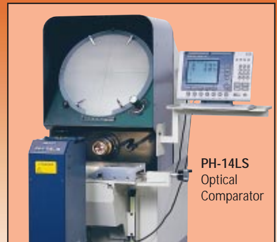
PH-14LS Optical Comparator