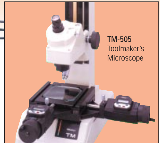
TM-505 Toolmaker's Microscope