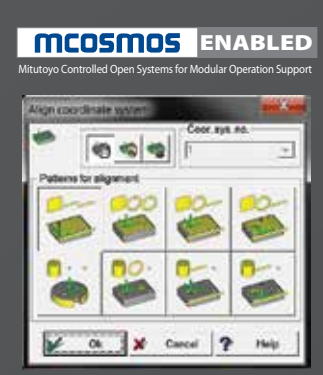
User Friendly MCOSMOS software

Save time and money on our CMM packages with Gold Care. Our Gold Care program helps simplify the overall purchasing, operation and support of selected Mitutoyo capital equipment offerings. The program, which is valued at more than $11,000 , delivers important supplemental equipment and extended services to support your operation at no additional charge .