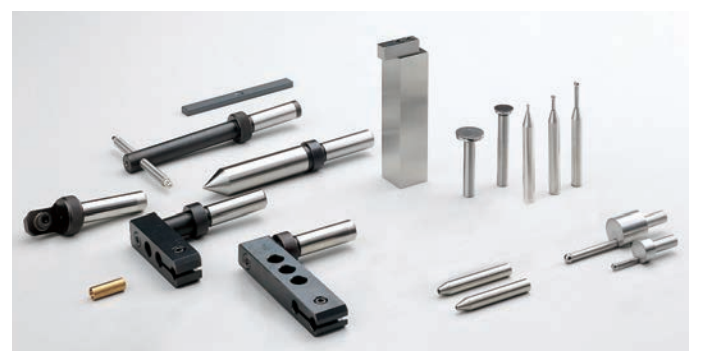
Numerous optional probes enable many types of measurement